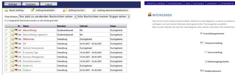
Fig. 2. CampusNews Management Console (left) and CampusNews Userweb (right)